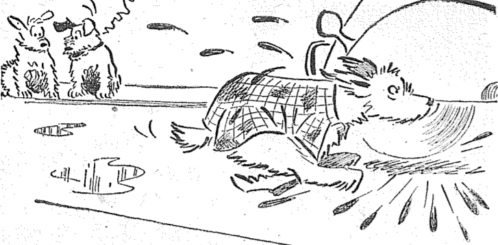
RAGS DOESN'T WORRY ABOUT GETTING HIS SWEATERS DIRTY - HIS FOLKS HAVE 'EM CLEANED AT -