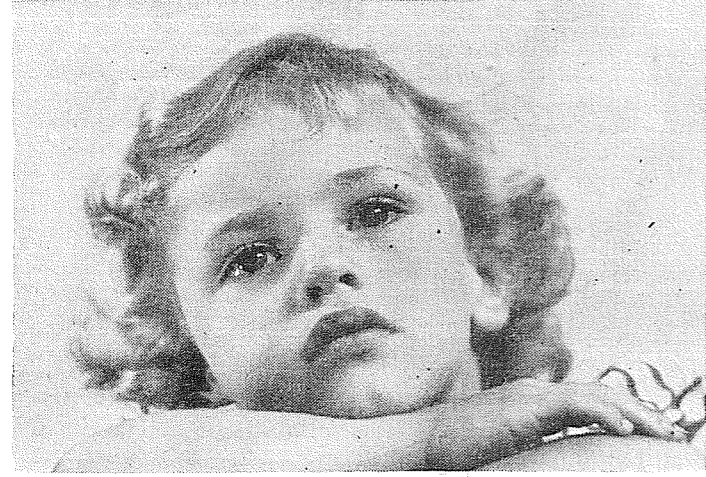
Have Doris make a picture like this of your child.

20 per cent discount on all sizes and styles if you bring this ad.