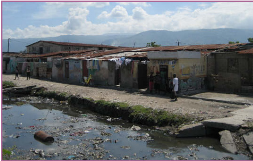
An open sewer is next to a row of shanty, zinc-roofed houses in Cite Soleil.

hurricanes and torrential rains. In spite of poverty, flooding, damage and destruction, I found among the Haitian people a hospitality and a deep joy I have seldom encountered elsewhere.