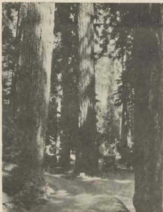
THE CAMP GROUND, COLTON

The facilities for recreation in Colton are unusual. Tennis and baseball will pro-