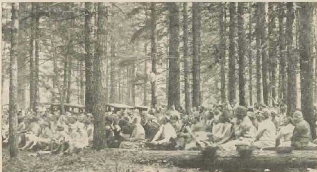
A SECTION OF THE AUDIENCE ATTENDING THE 1929 INSTITUTE AT COLTON, ORE.

The bonfire programs will not be very lengthy, but you will enjoy them. Those few minutes around the bonfire will serve as a closing benediction and a gathering together of the thoughts and experiences of the day.