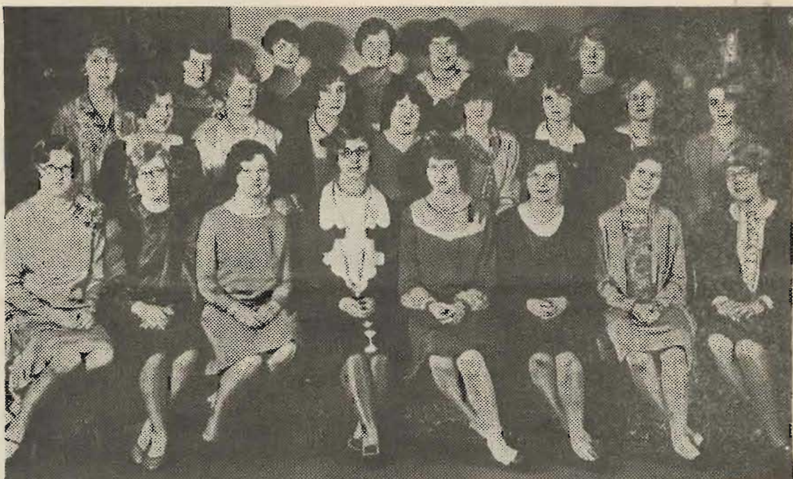
GIRLS' CHORUS, IMMANUEL LUTHERAN CHURCH, PORTLAND, WHO WILL SING AT THE BIBLE INSTITUTE, SUNDAY AFTERNOON, JULY 13

vide exercise for those who love "the strenuous life." Swimming is provided only a short distance from the Luther League cottage. Opportunities to engage in the more sedate sport of "barnyard golf" will be numerous. Let's see, who was the champion last year? I believe he hails from Astoria. You will find your own best form of recreation, and — you will find those who will enjoy it with you.