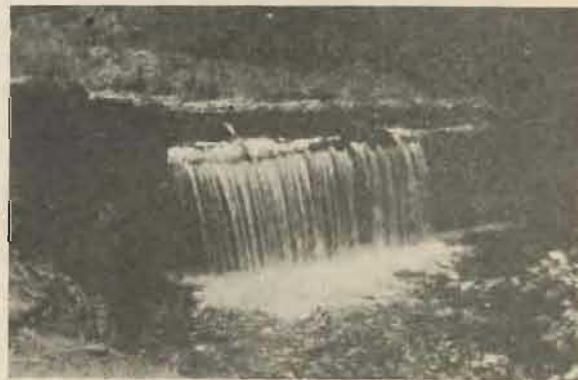
WATERFALL, CANYON CREEK, COLTON

Your expenses here will be very little more than if you were staying at home.