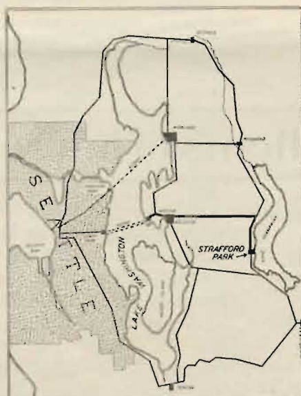
Map showing roads as they lead to Stafford Park.

signs. Ferries from Leschi Park, Seattle, go across Lake Washington to Medina, and some of them connect with buses to Lake Sammamish.