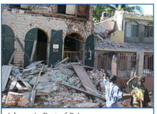
A home in Port-of-Prince.

Donations—Thrivent Financial for Lutherans announced that they will match members' gifts to LWR for Haiti, giving $1 for every $2 donated, up to $1 million. Thrivent Financial members interested in making a financial gift to help earthquake victims in Haiti can make their donation online at www.thrivent.com/helpinghaiti or by phone at 1-800-236-3736 between 7 a.m. and 6 p.m. Central time, Monday through Friday. When prompted, please say "directory" then enter ext. 83003. Thrivent