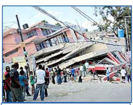
The hospital in Port-of-Prince.

ELCA has long-standing relationships in Haiti through several organizations and the Lutheran Church in Haiti.)