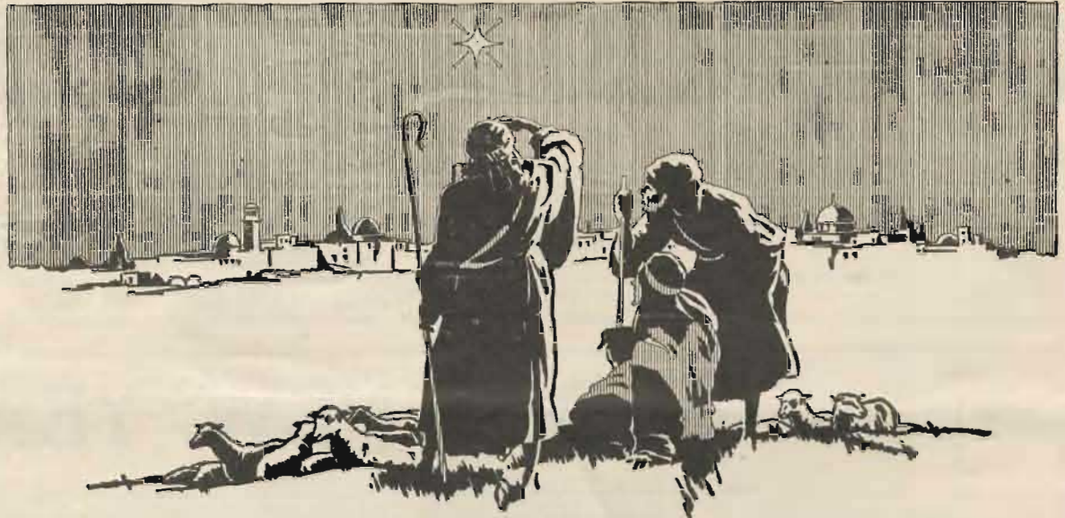
"AND LO, WHEN THEY SAW THE STAR, THEY WERE VERY GLAD."