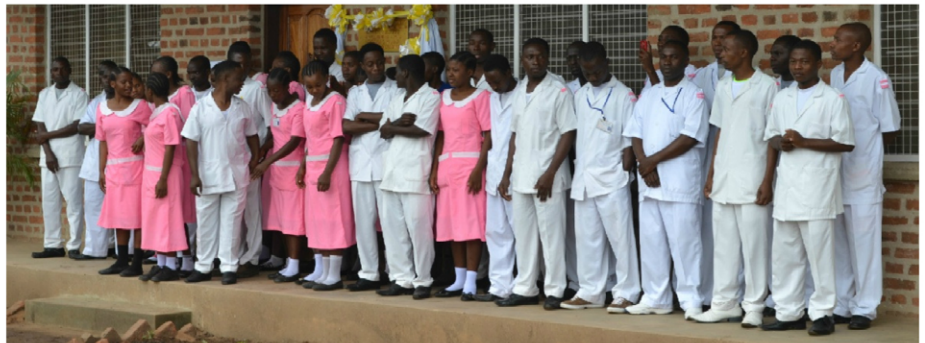
Top: Nursing students at Lugala Lutheran Hospital Below Left: Hospital beds with mosquito nets in need of replacement Below Right: Solar batteries that store energy during the day for nighttime operation

Being in rural Africa, the hospital is not connected to an electrical grid and only has full generator-provided electricity for three hours a day. Three separate diesel engines run to provide electricity. However, these engines consume two gallons of diesel fuel per hour which is extremely expensive and difficult to source in rural Tanzania. Dependency on electricity provided by generators has always been a challenge at Lugala. In years past, the EWAID Synod was instrumental in providing support to build a solar power infrastructure so that vital life saving equipment could operate throughout the day and at night when the diesel generators are shut down. Sunshine to power solar panels is much more cost effective than diesel fuel. Support from the EWAID Synod to provide replacement batteries will go far to maintain and expand the electrical capacity of the hospital and to allow life saving equipment to run both day and night.