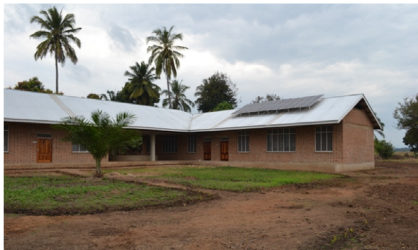
Above: A wing of Lugala Lutheran Hospital with solar panels on the roof Bottom Left: Three diesel generators that provide power for the hospital Bottom Right: Nursing students singing at the dedication of a new building