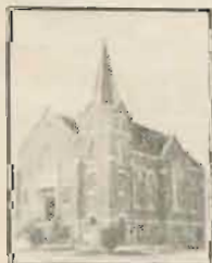
SALEM LUTHERAN CHURCH