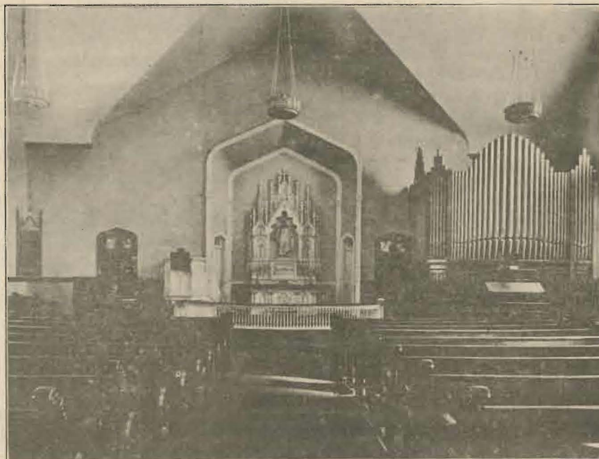
INTERIOR OF IMMANUEL CHURCH, PORTLAND