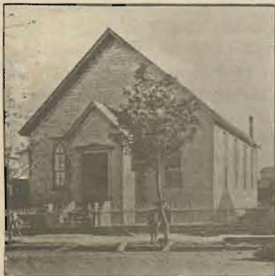
IMMANUEL CHURCH, 1883