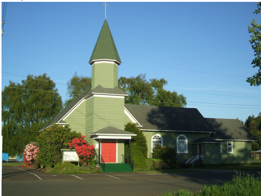
First Lutheran, South Bend