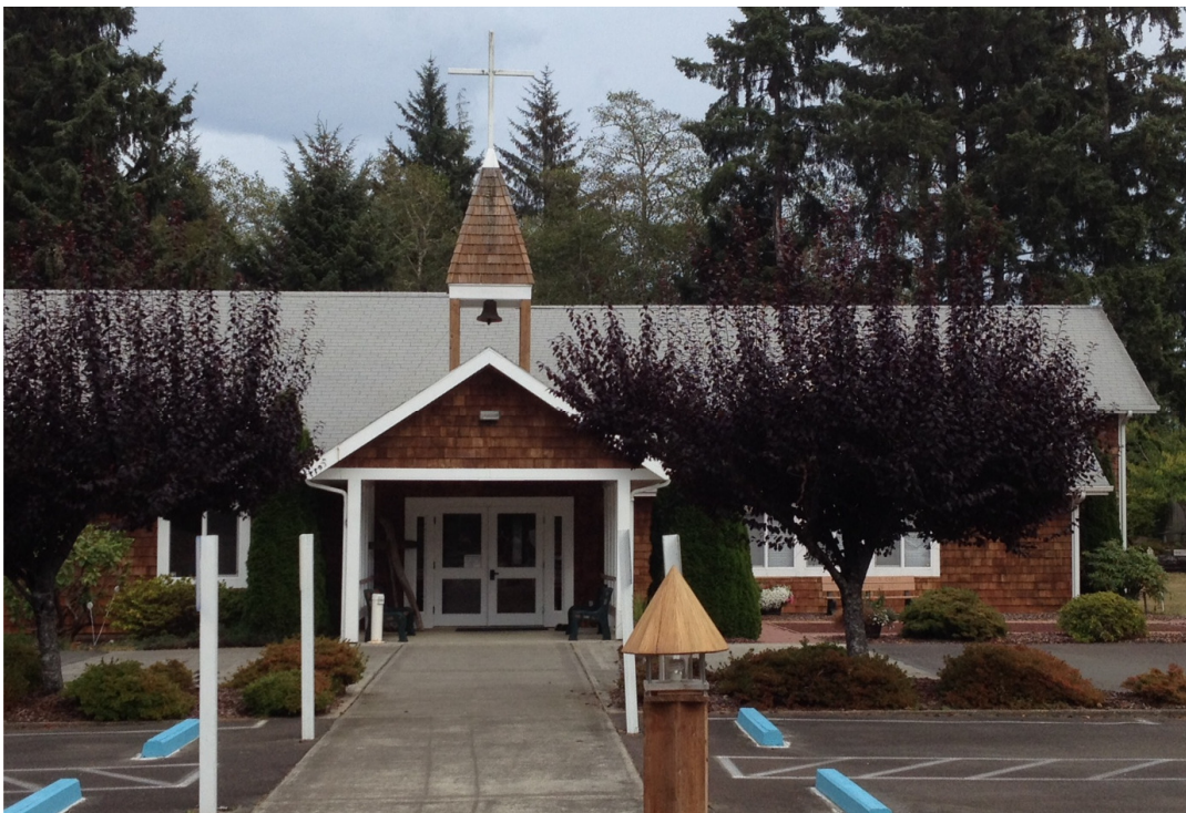
Ocean Park Lutheran

to have a vibrant base. During a potluck dinner at Chinook Lutheran, I enjoyed hearing church members describe the many ways in which they care for and welcome their neighbors around them, working with community groups and schools.