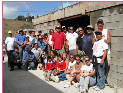
The group from Trinity alongside their new Mexican friends.

The work was hard. We mixed 100 loads of concrete for