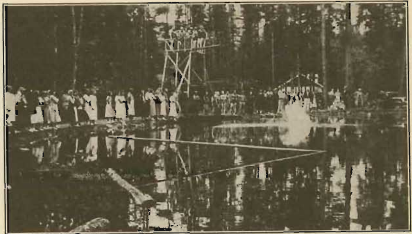
COLTON PARK SWIMMING POOL