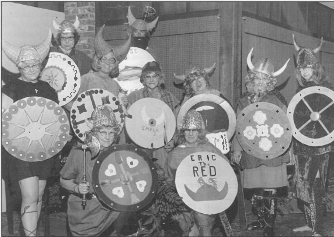
Who says Embla does not have fun? Embla Vikings at the Grand Lodge Convention in Butte, Montana