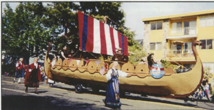
Syttende Mai Parade, Ballard, May 17, 2003