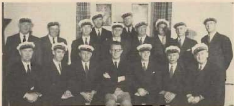
SAN FRANCISCO CHORUS