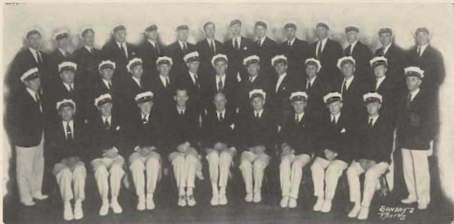
VANCOUVER, B. C. CHORUS