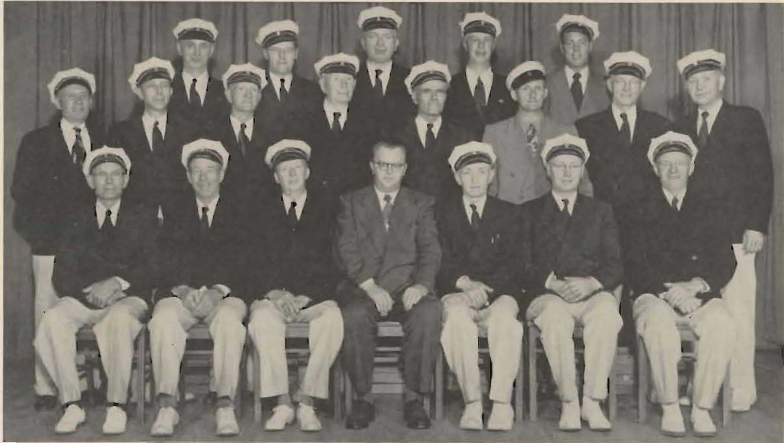
LOS ANGELES CHORUS