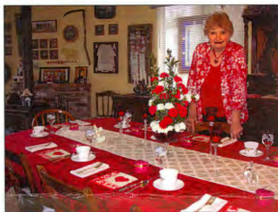
Esther set a beautiful table for the February 14 meeting