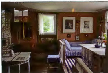
Dining room at Carl Larsson's home near Rättvik, Sweden

Then it's on to Sweden to see Mårbacka, the home of another Nobel Prize winner, Selma Lagerlof. We will also visit the homes of Carl Larsson near Rättvik and Anders Zorn in Mora. In Stockholm we can see sculptures by Carl Milles at Millesgården. After leaving Stockholm, we can stop at the home of Astrid Lindgren at Näs in Vimmerby.