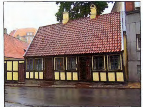
H. C. Andersen's Childhood Home in Odense

In Oslo, Norway, we'll stroll through Frogner Park and see statues by Gustav Vigeland. Then we'll go to Bergen to visit the home of composer Edvard Grieg. We'll travel through the countryside to see the home of Nobel prize-winning author Sigrid Undset in Bjerkebak.