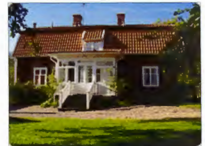
Astrid Lindgren's childhood home

Then it's on to Sweden to see Mårbacka, the home of another Nobel Prize winner, Selma Lagerlof. We will also visit the homes of Carl Larsson near Rättvik and Anders Zorn in Mora. In Stockholm we can see sculptures by Carl Milles at Millesgården. After leaving Stockholm, we can stop at the home of Astrid Lindgren at Näs in Vimmerby.