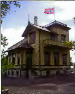
Troldhaugen - The Edvard Grieg Museum In Bergen

Would you like to take an imaginary trip through Scandinavia visiting the homes of well known Scandinavian artists? You can! Just attend the April meeting of Embla #2 and we're off!