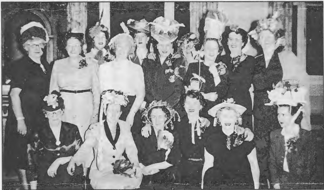
EMBLA Hat Party in the 1950s

Back row left to right: 1 _____ 2 _____ 3 _____ 4 _____ Middle row: 1 _____ 2 _____ 3 _____ 4 _____ 5 _____ 6 _____ 7 _____ Front row: 1 _____ 2 _____ 3 _____ 4 _____ 5 _____ 6 _____