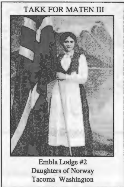
Embla Lodge #2 Daughters of Norway Tacoma Washington