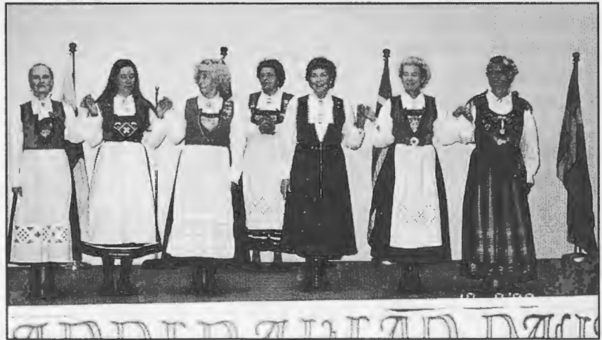
The Leikarring performing for Scandinavian Days