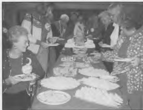
What beautiful tables for Christmas. You missed something good.