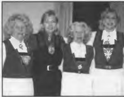
Escort Team for 2007 Installation of Officers.