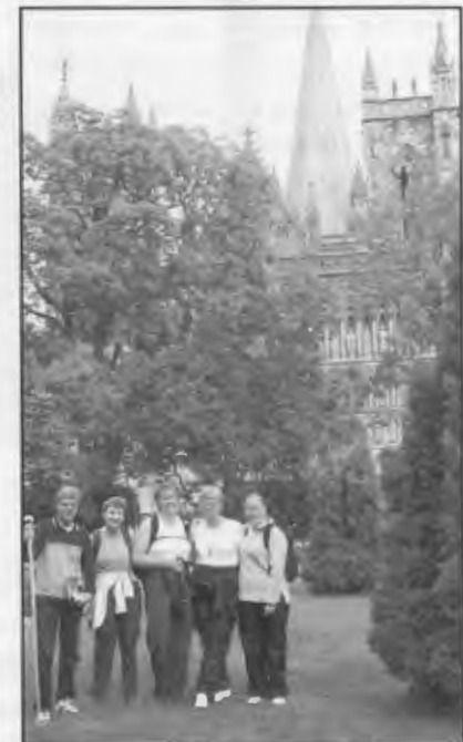
At the Goal!!!