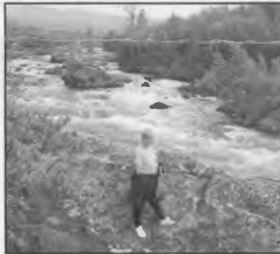
Closer to Kjerkinn.

And, it was fun! We started in Oslo, and then visited such places as the Hamar Cathedral, Dovre Church, and Saint Olav's Spring. We followed the old Kings' Road over the mountain, visited Eystein's Church, named after the Norwegian king who built the first church in the area around 1100. The day we arrived at the Gaula river, the farmer at Sundet Gård met us with his boat and rowed us over, three at a time. It has long been the medieval duty of the farmer at this place, and he has accepted the age-old obligation.