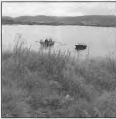
Approaching the shore near Sundet. Family owning the house on this side of the water must row across and bring over any travelers.