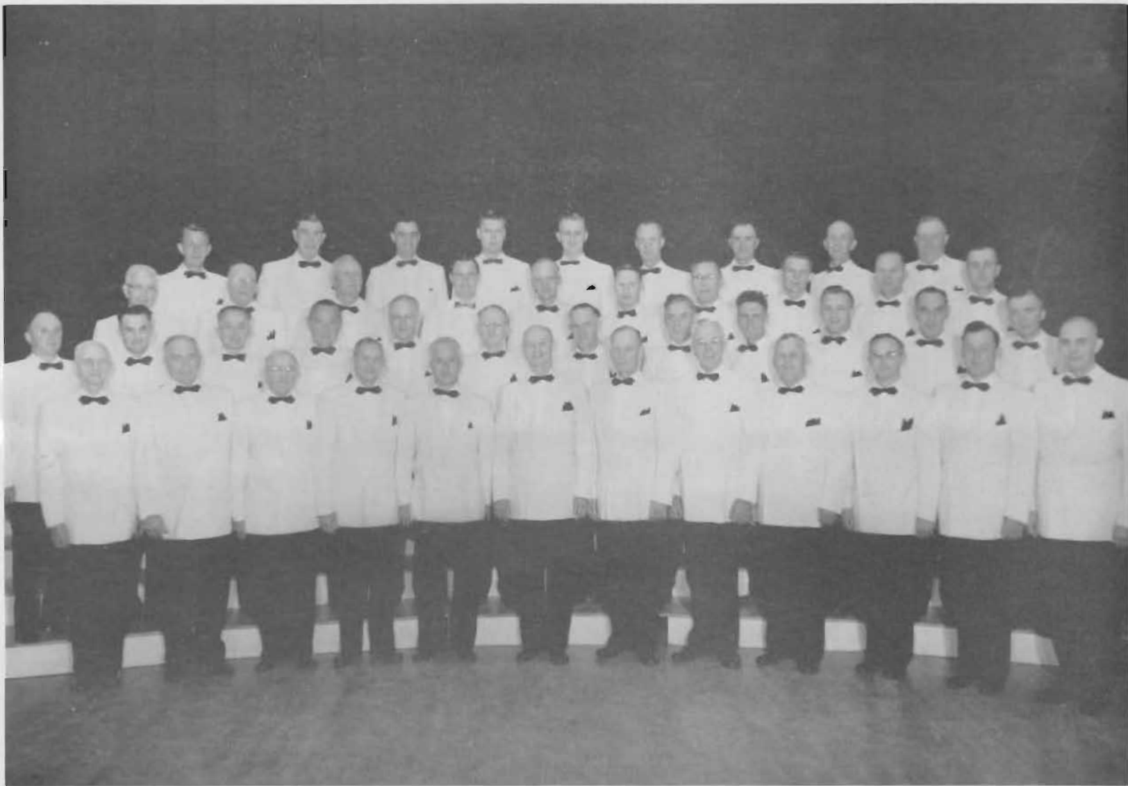
NORWEGIAN MALE CHORUS, EVERETT, WASHINGTON