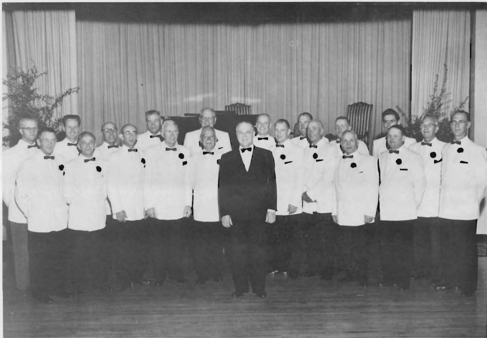
NORMANNA GLEE CLUB, OAKLAND, CALIFORNIA