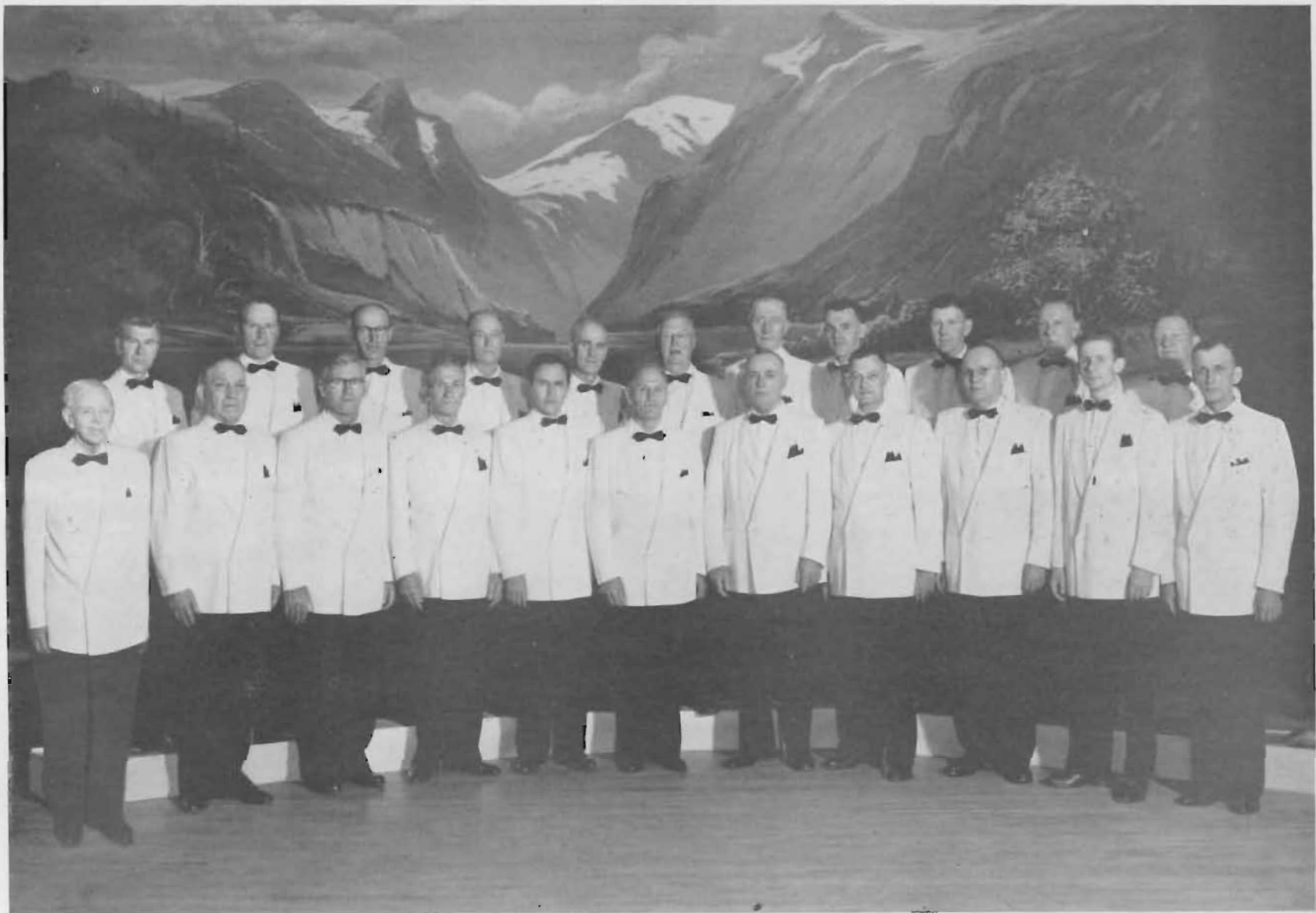
THE NORWEGIAN GLEE CLUB, PORTLAND, OREGON