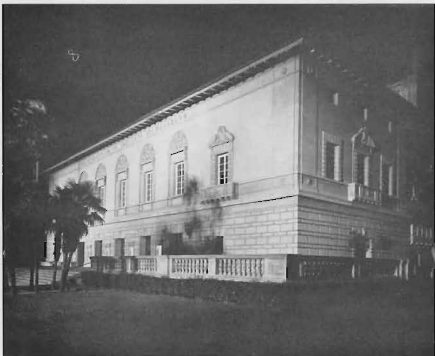
Pasadena Civic Auditorium