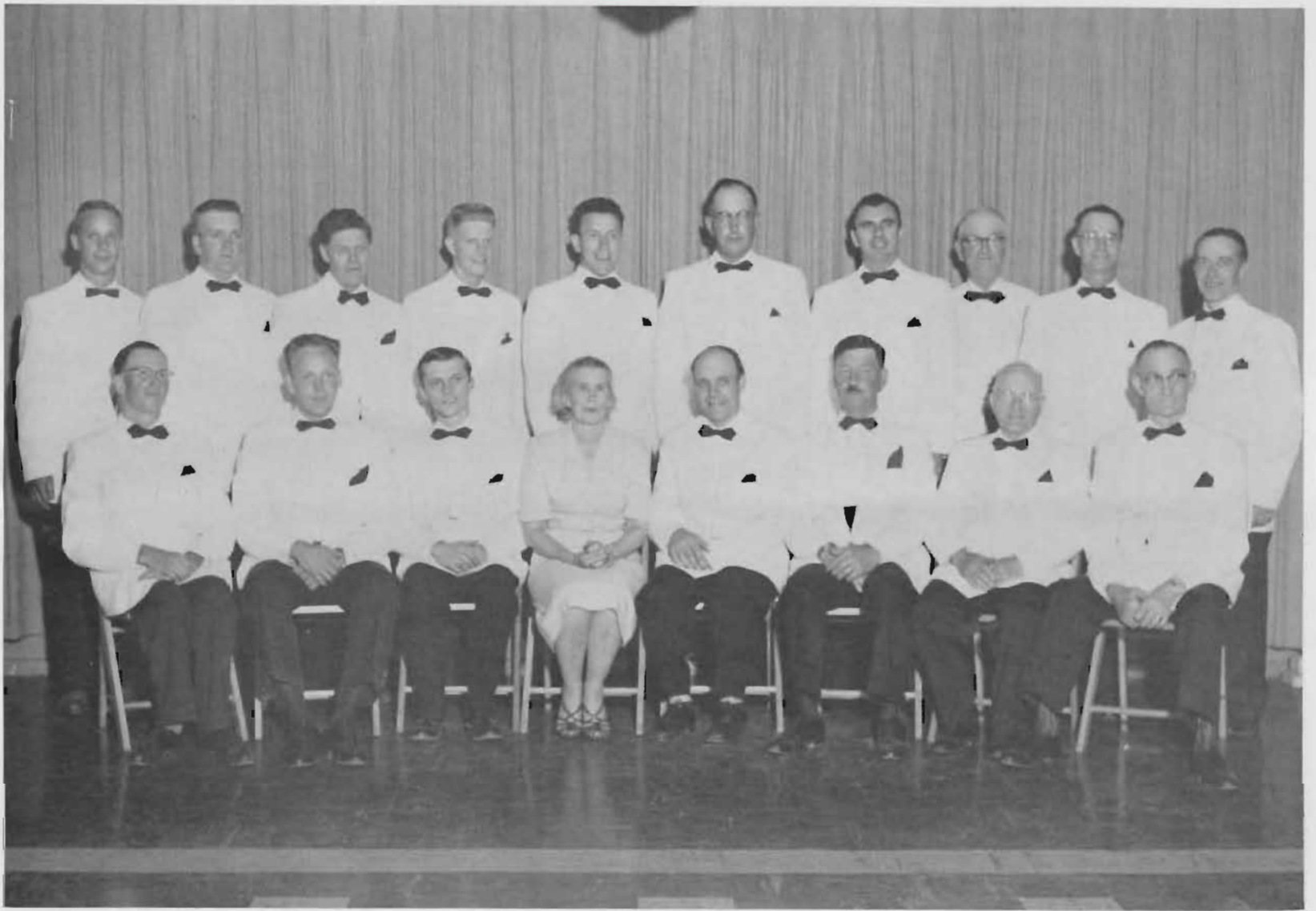
BELLINGHAM MALE CHORUS, BELLINGHAM, WASHINGTON