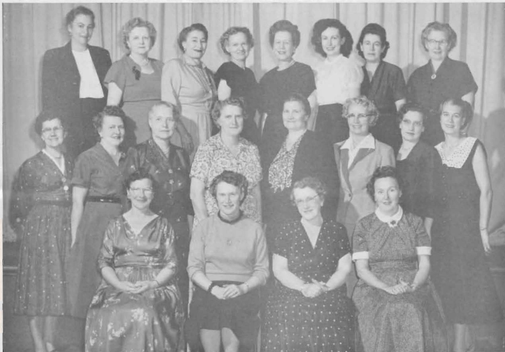
THE LADIES AUXILIARY