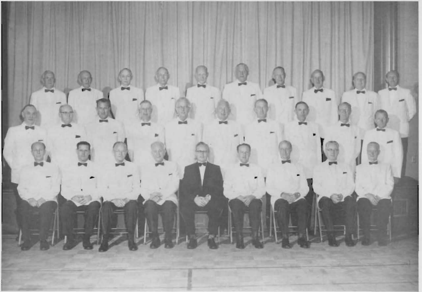
NORWEGIAN MALE CHORUS, LOS ANGELES, CALIFORNIA