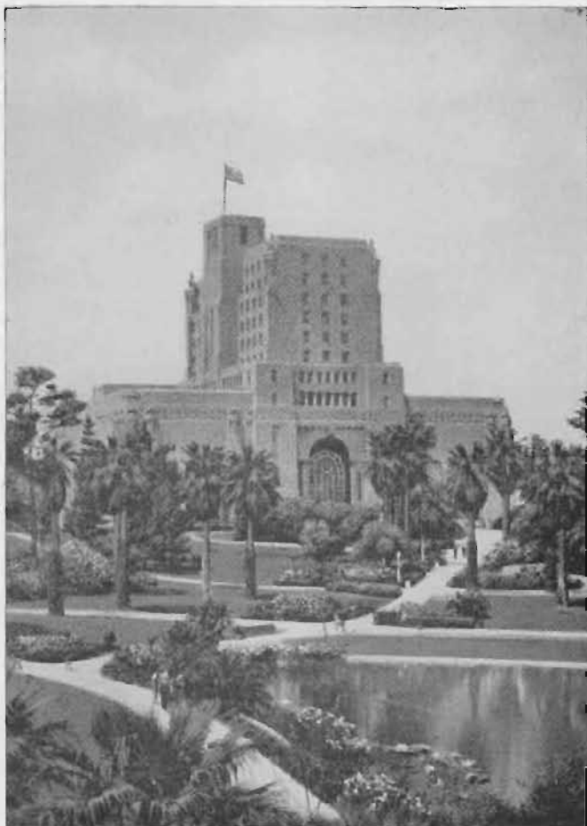
Headquarters, Los Angeles Elks Club