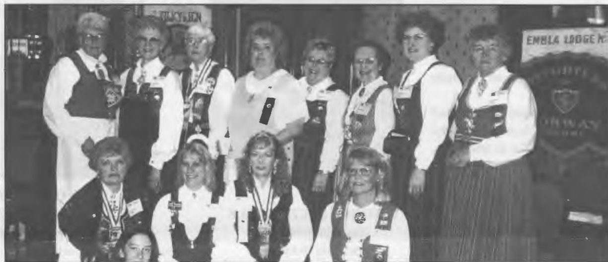
Grand Lodge Convention, Embla Lodge #2 Delegates