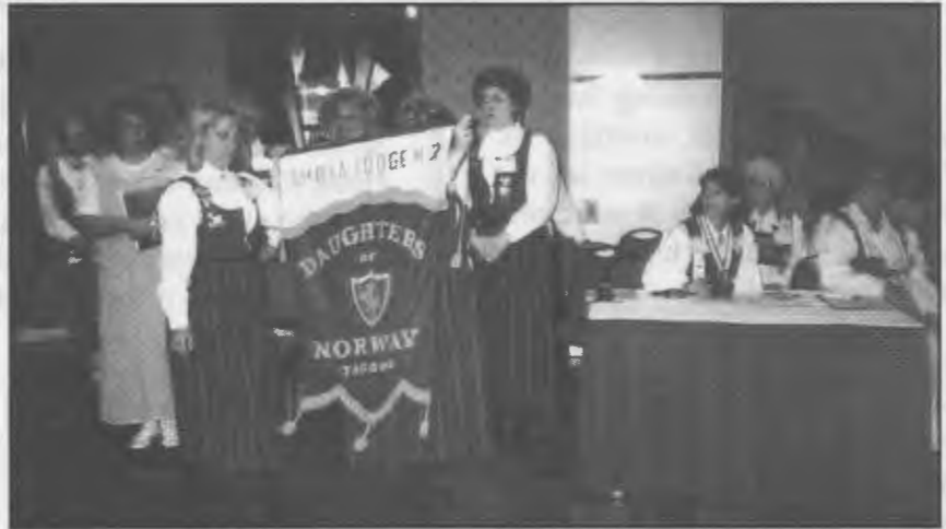
Embla marching in for Bunad Day Parade

Luncheon was served in the same room. We were each given a floral refrigerator magnet as a gift from the host lodge. All enjoyed a delicious roast beef luncheon followed by a tasty sherbet.