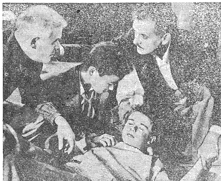
"BAREFOOT BOY" now at Beverly

"The rising necessity for more equal distribution of economic wealth gives us an opportunity equal to, if not of greater importance than, that which our forefathers had when they laid the foundation of the religious and political freedom we now enjoy"