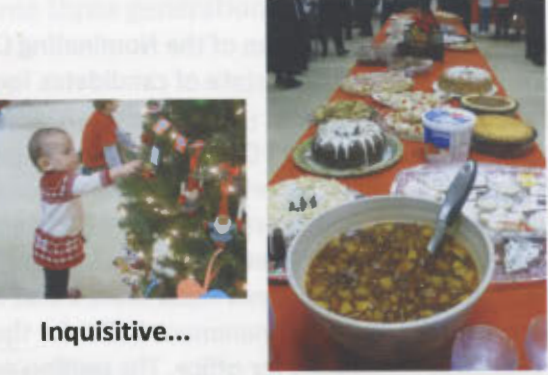
The food table