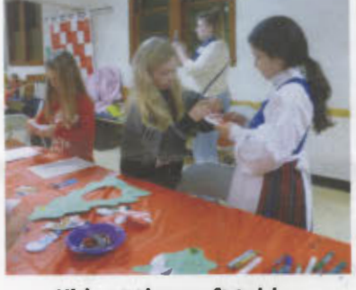
Kids at the craft table