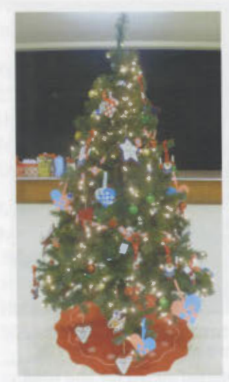
The Christmas tree