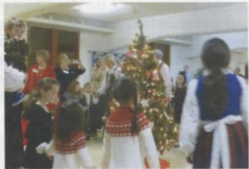
Dancing around the tree