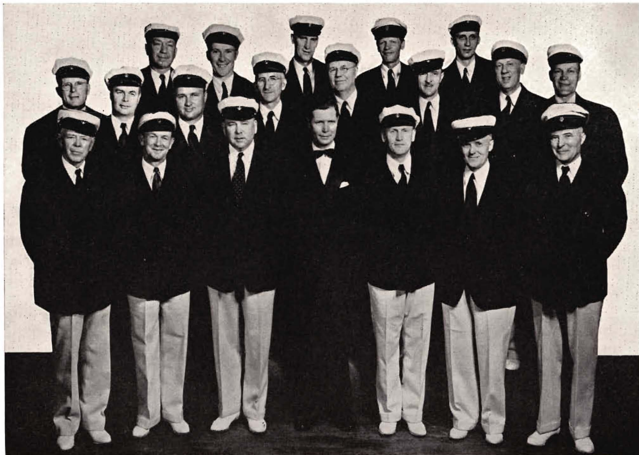
NORWEGIAN GLEE CLUB, Portland