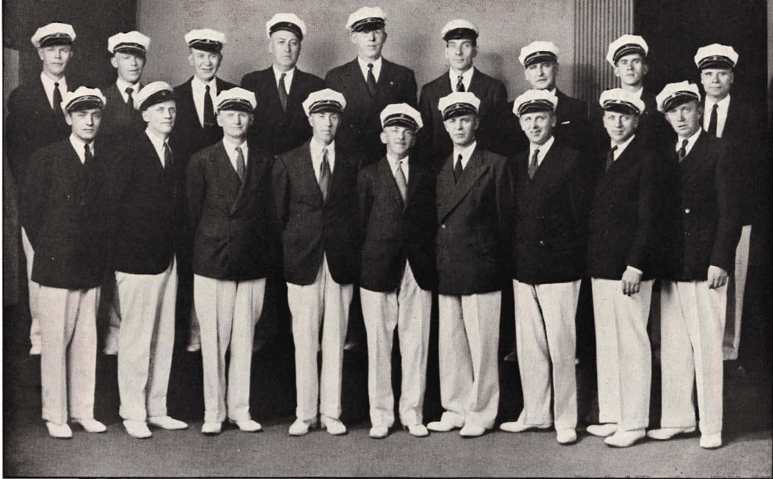
GRIEG MALE CHORUS, Gray's Harbor