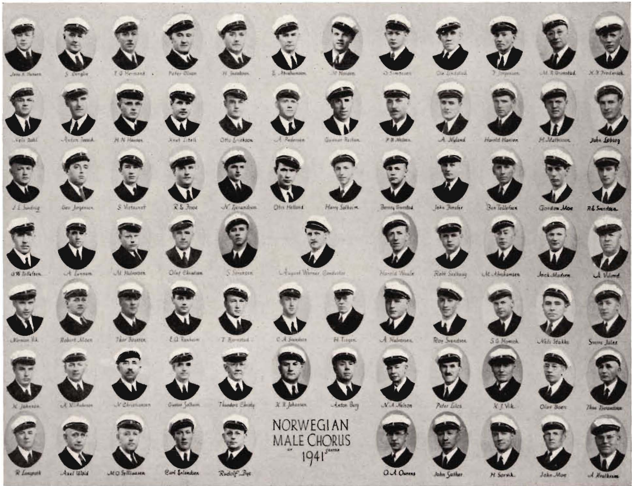
NORWEGIAN MALE CHORUS, Seattle