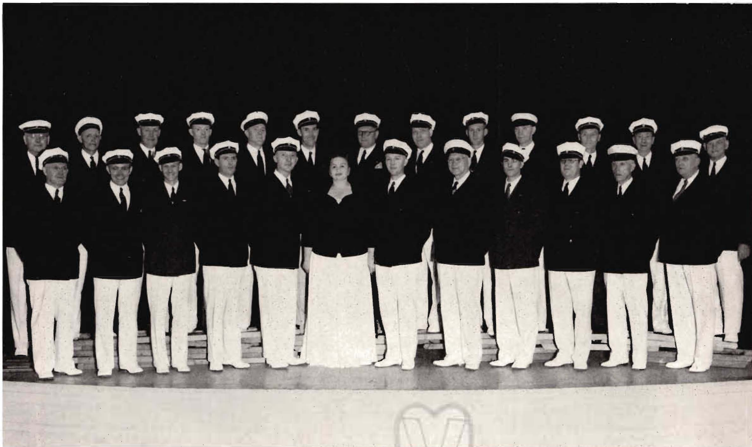
NORMANNA MALE CHORUS, Tacoma