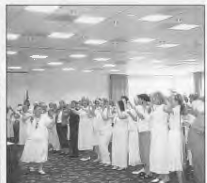
One of our Daughters of Norway sisters could not leave the Convention without dancing. She is seen here teaching the ladies the "Chicken Dance." It was great fun!