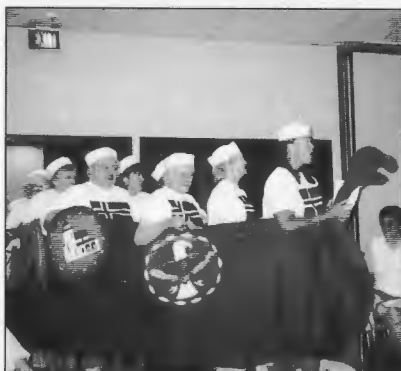
Ester Moe Lodge of Whidbey Island present a skit inviting us to the next Grand Lodge Convention in 2004