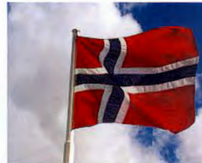
Happy Joining Anniversary!