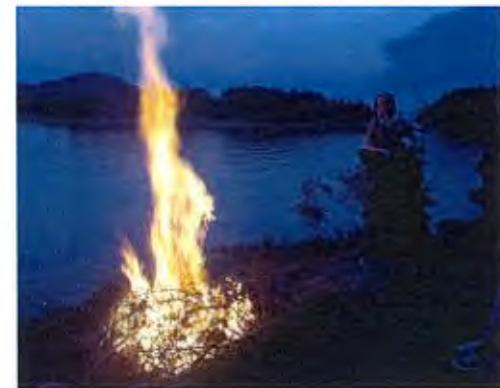
The bonfire on our serving table wasn't real - like this one - but it was really nice!