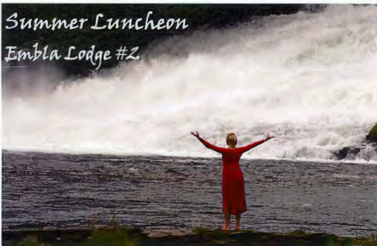
Summer Luncheon Embla Lodge #2