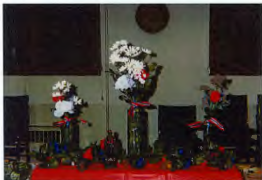
May flowers on the serving table