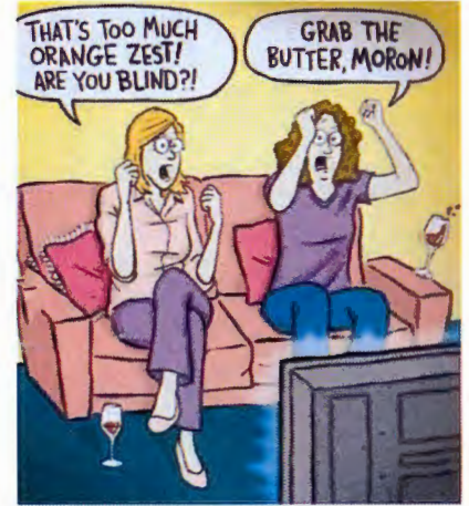
IF WE WATCHED COOKING SHOWS THE WAY GUYS WATCH SPORTS