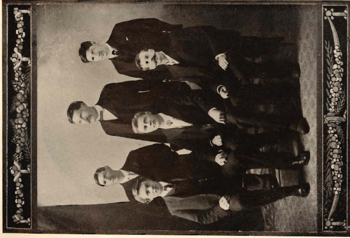
BALLARD ISL. SINGING SOCIETY