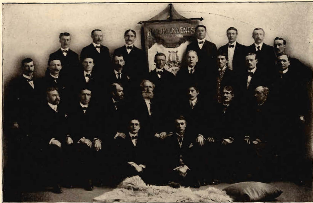
SAN FRANCISCO S. S.