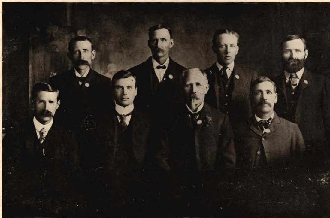
BARLOW S. S.