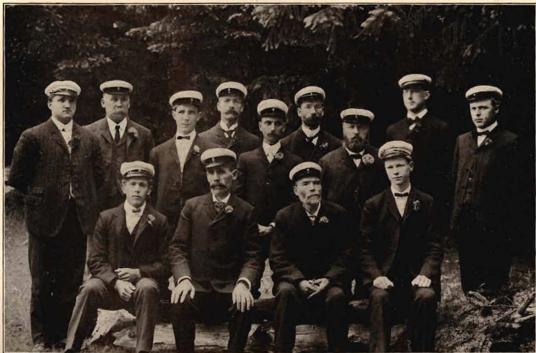
PARKLAND SINGING SOCIETY