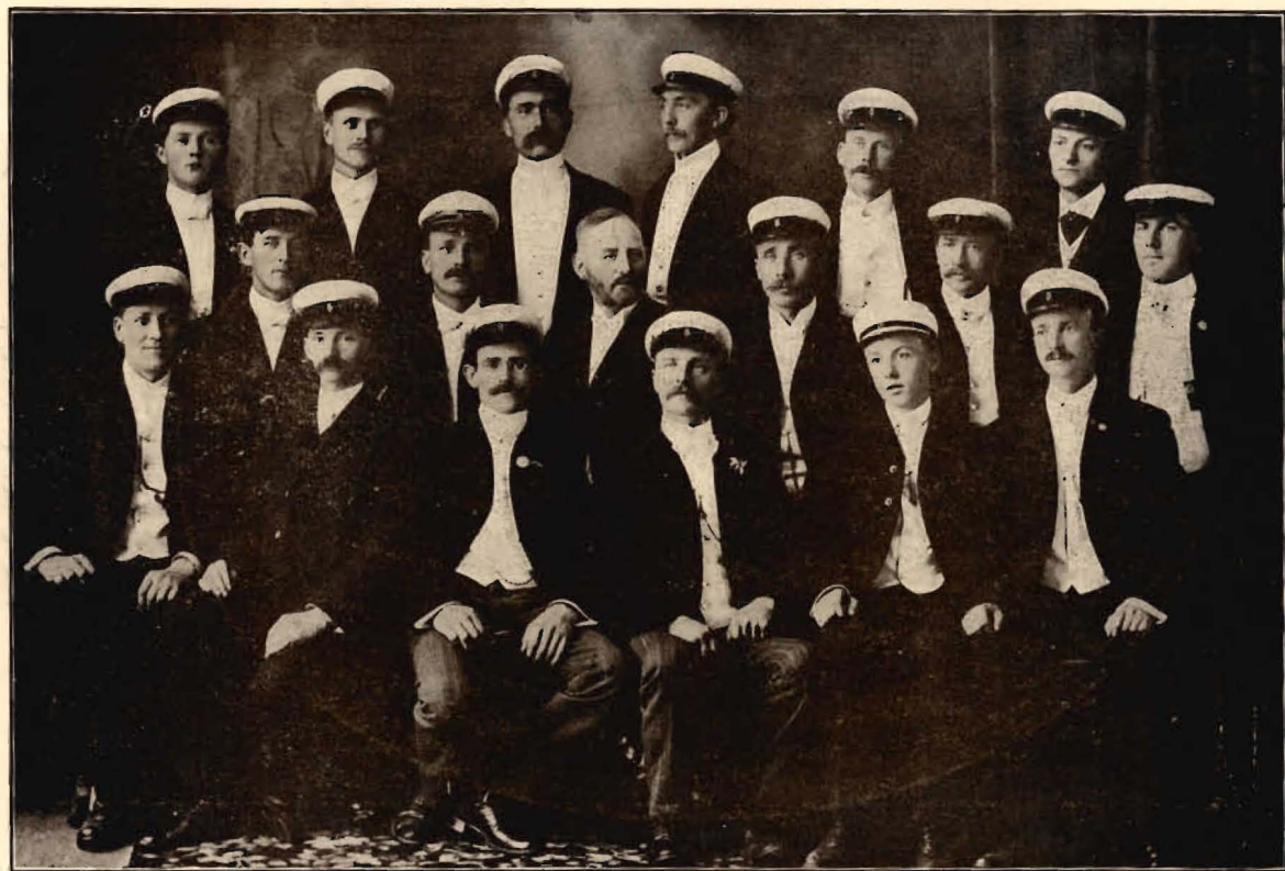
EVERETT S. S.