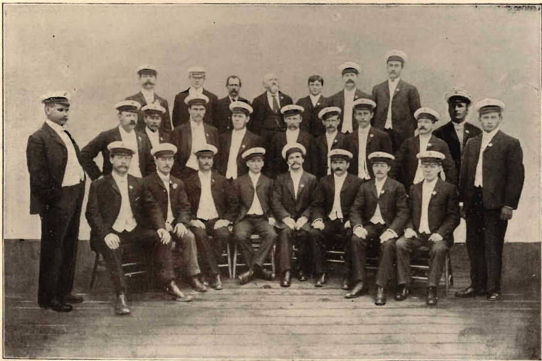
ASTORIA SINGING SOCIETY