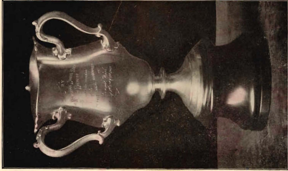
The Everett Cup

All the Societies will compete for this cup, which prize is now held by the Seattle Sing- ing Society :: :: :: ::