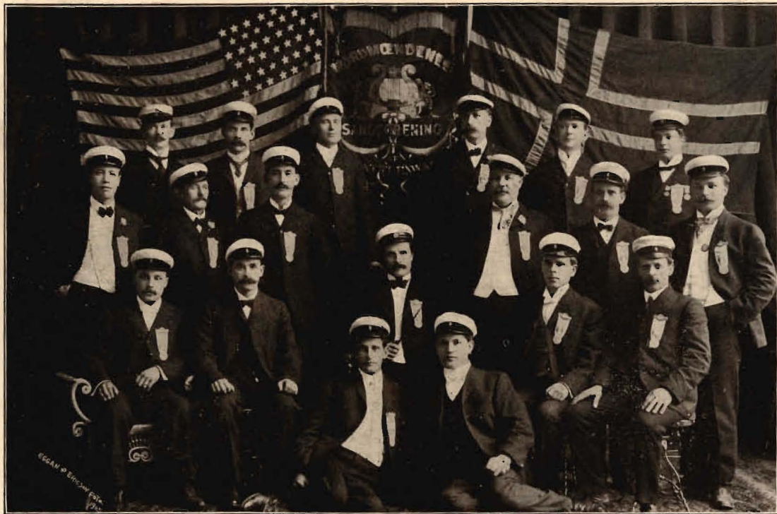
SEATTLE S. S.