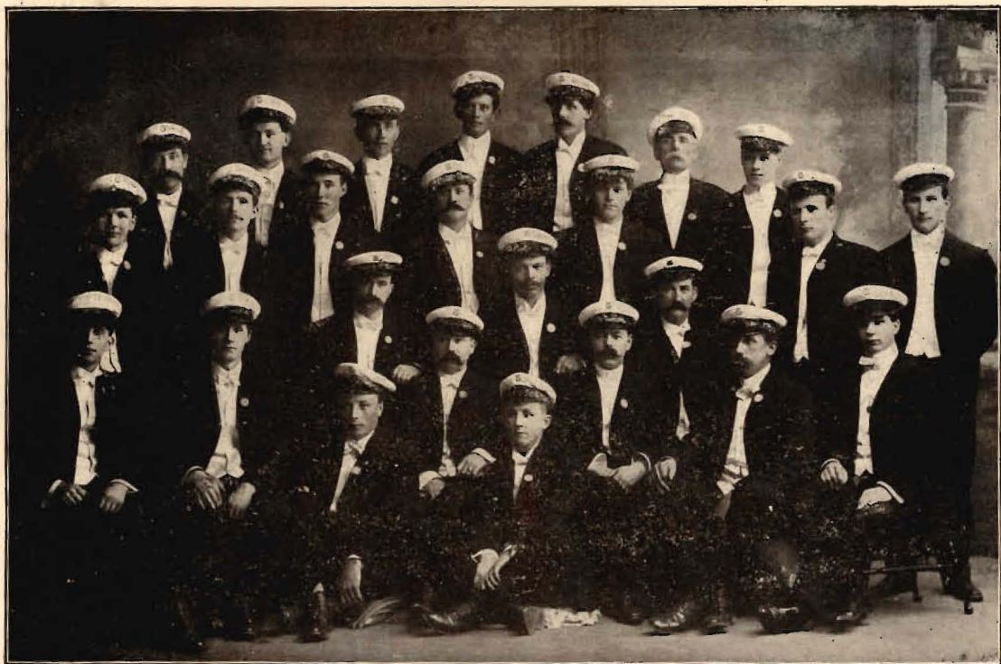
PORTLAND S. S.