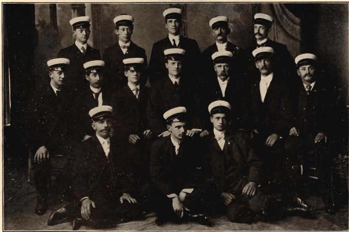
EUREKA SINGING SOCIETY