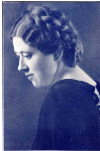
ELLEN REEP Contralto