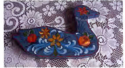
The Rosemalers group has added more items to the table.