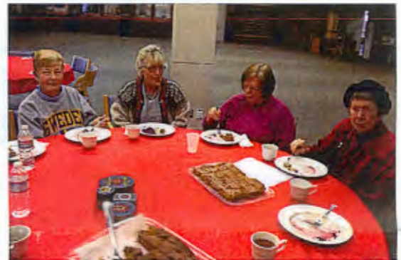
Tasting the results

You don't want to miss these classes - they are fun, informative, and we all enjoy our lunch together.