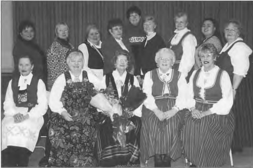
Embla Lodge #2 Officers for 2006