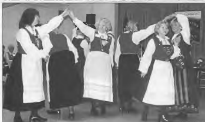
The Leikarring at the 2006 Installation of Officers

Happy New Year to all our Sisters in Embla Lodge #2!!!