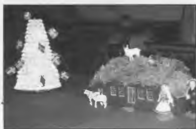
Table decorations at the Installation meeting – January 2006

Above: Kransekake and a Norwegian Seter (mountain farm house)