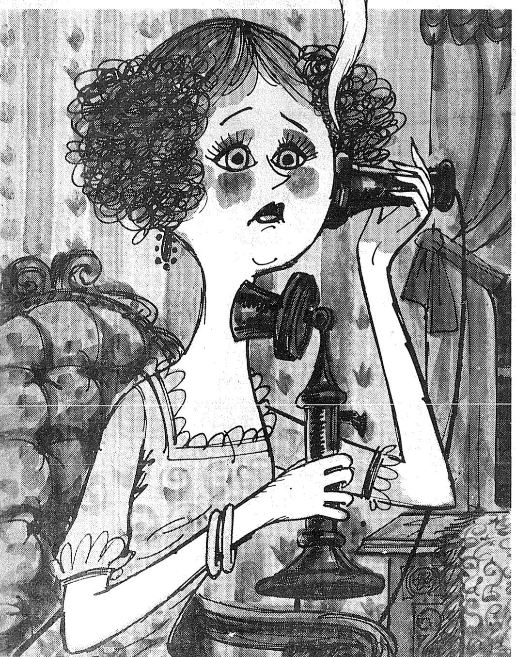
(Today folks call long distance just for the pleasure of it)

Remember when "THIS IS LONG DISTANCE" usually meant bad news?