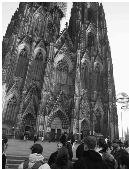
PLU J-Term students learn about the rich history of Cologne's famed cathedral.

Many of PLU's German students embrace the opportunity to study abroad. In fact, more than thirty-five German students have studied in Germany (Cologne, Freiburg, and Berlin) or Austria (Vienna and Salzburg) in just the past two years. These students return with a heightened awareness of the vibrant, multicultural character of the German-speaking countries and of their importance within the new Europe. The German skills of students who study abroad are always much sharper after even a J-Term, and they truly energize our classes when they return to campus. The annual J-Term program in Cologne, now in its sixth year, has emerged as a vital component of our German program. In partnership with EuroCentres Language School, PLU students who have completed a minimum of three semesters of German enjoy three weeks of outstanding language instruction.