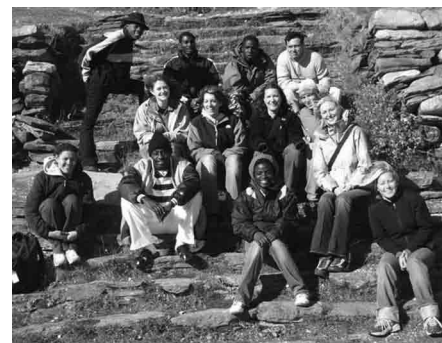
Students on the Hedmark, Norway program enjoy an excursion with Namibian peers.

The Scandinavian Studies Program at PLU is committed to providing its majors and minors many possibilities to create a meaningful program of study that will be relevant to life and work beyond college years. Study of Scandinavia presents a unique opportunity to see the world through the eyes of small Nordic societies, and encourages students to integrate the skills and knowledge they acquire while at PLU into an active engagement in their local and global communities. Such a commitment requires diverse Scandinavian Studies courses and co-curricular events on campus, as well as the opportunity to study away.