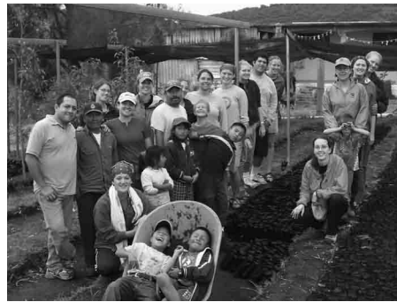
Students and members of the Mixtec community of La Unión Soyaltepec gather for a picture after filling 4,000 bags of earth for a reforestation project that has already planted 40,000 trees in the area.