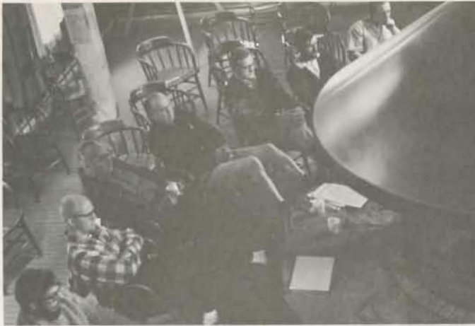
Koinonia House. . .just before the President ordered more logs on the fire