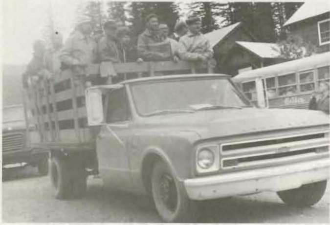
The hardy dust eaters head for Lucerne