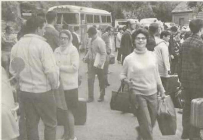
Mass confusion at 25-Mile Creek