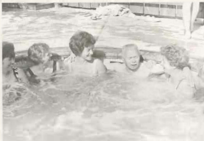
Who's the thorn among all those lovelies?