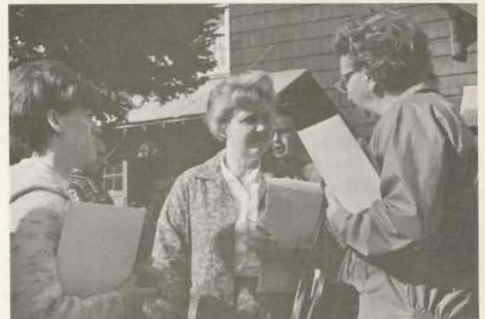
Nurses take coffee breaks, too