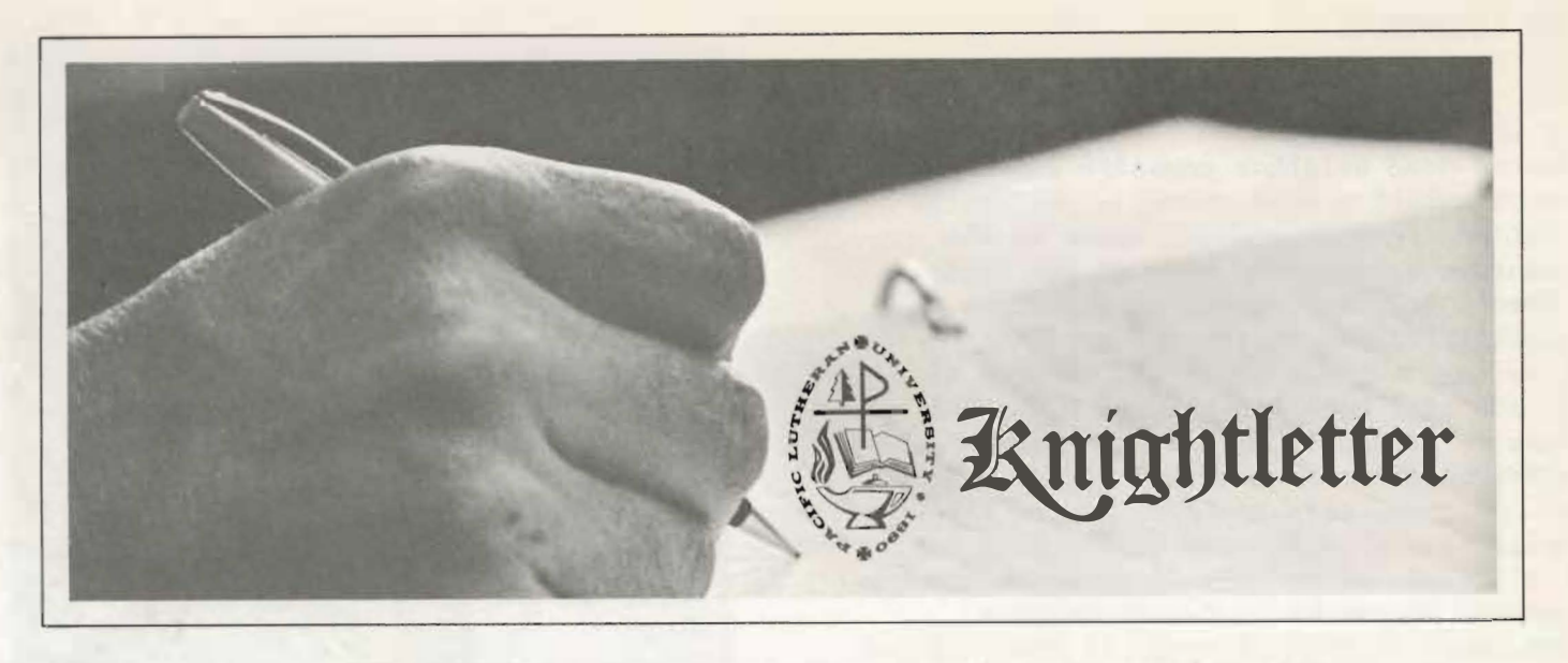
VOL 7 NO 3 Pacific Lutheran University September 25, 1969