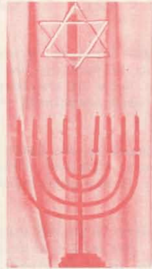
art work as found on the windows of PLU's womens residence halls