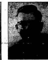
Bottom row, left to right: