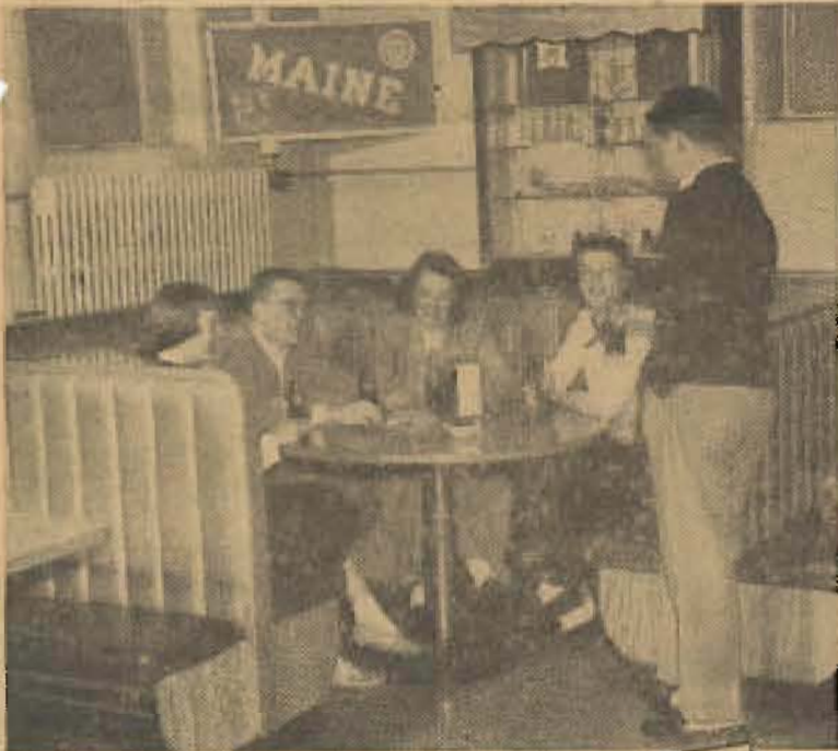
Snack Bar in Carnegie Library University of Maine Orono, Maine