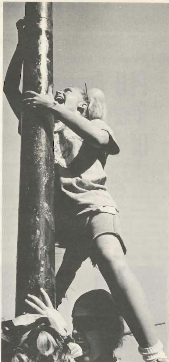
Thing of the Past -- pole climbing