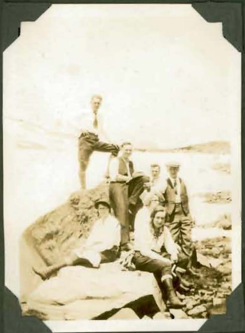
Resting on way to Anvil Rock.