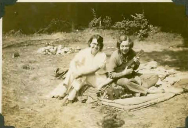
Hittin' up the Uke; "Secretarial Blues"