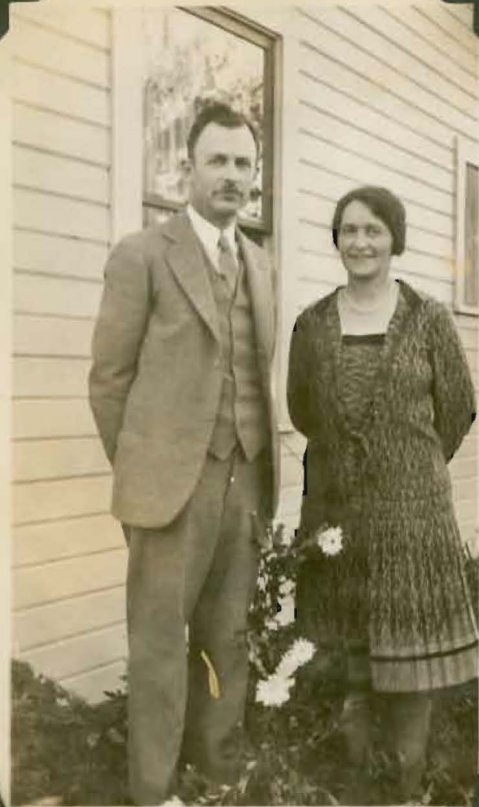
Dad & Mom