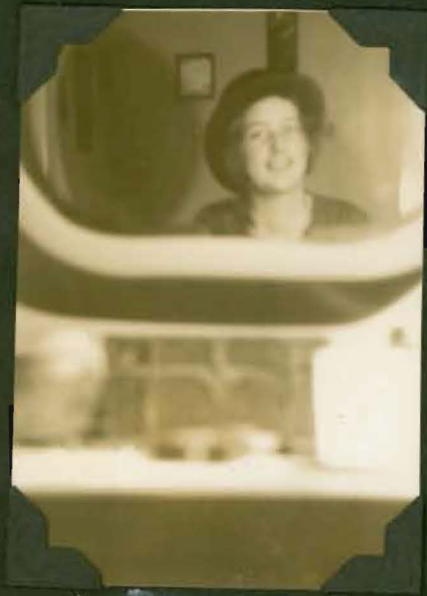
The Image in the Mirror