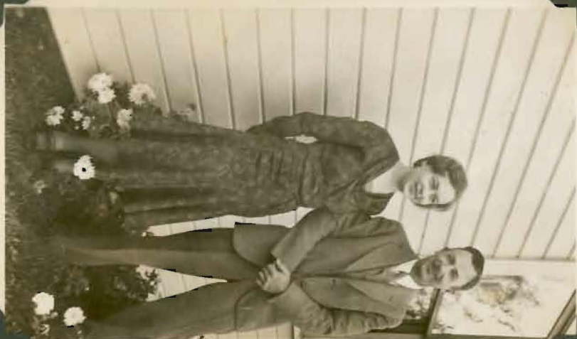
Daughter & Mom n' Pop