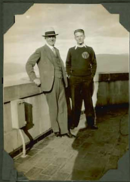
Aleck & Vernon Vista House Columbia Highway