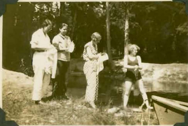
Dinner Dishwashing in the Creek.