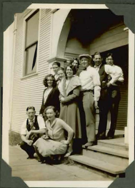
Ready to leave "Buck & de Gang—"