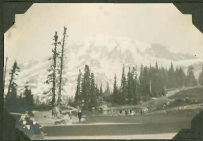
The Mountain from Paradise Valley