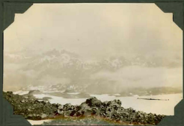
Up in the Clouds — from Anvil Rock.