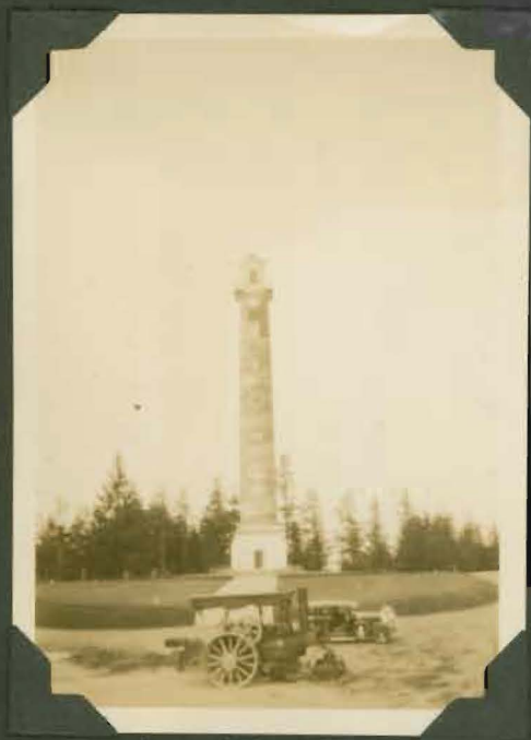
The Tower at Astoria