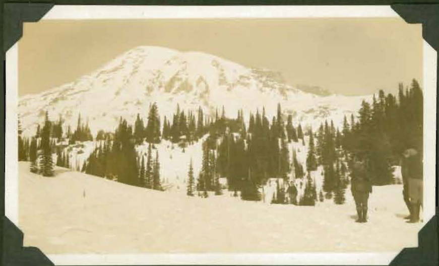
On the way to Paradise