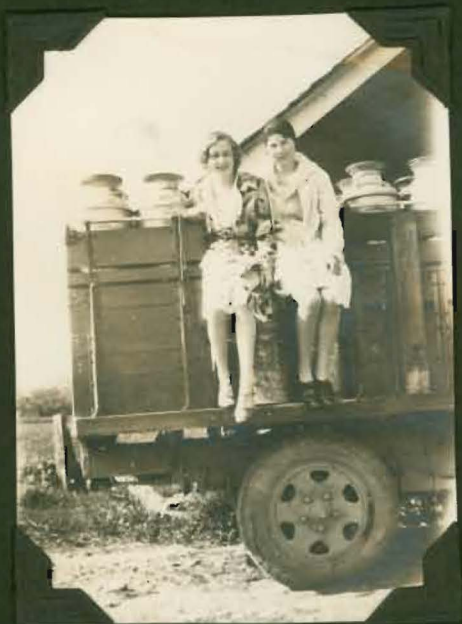
2 Assistants ??