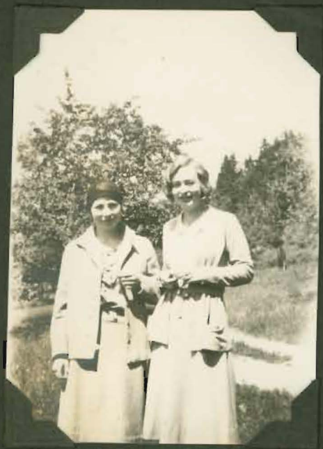
SKiss & ID