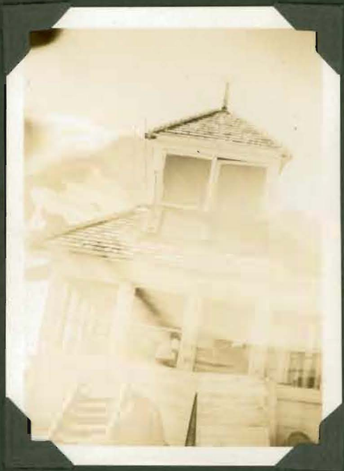
Guide Cabin at Anvil