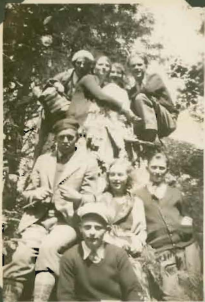
In the old stump up the Trail