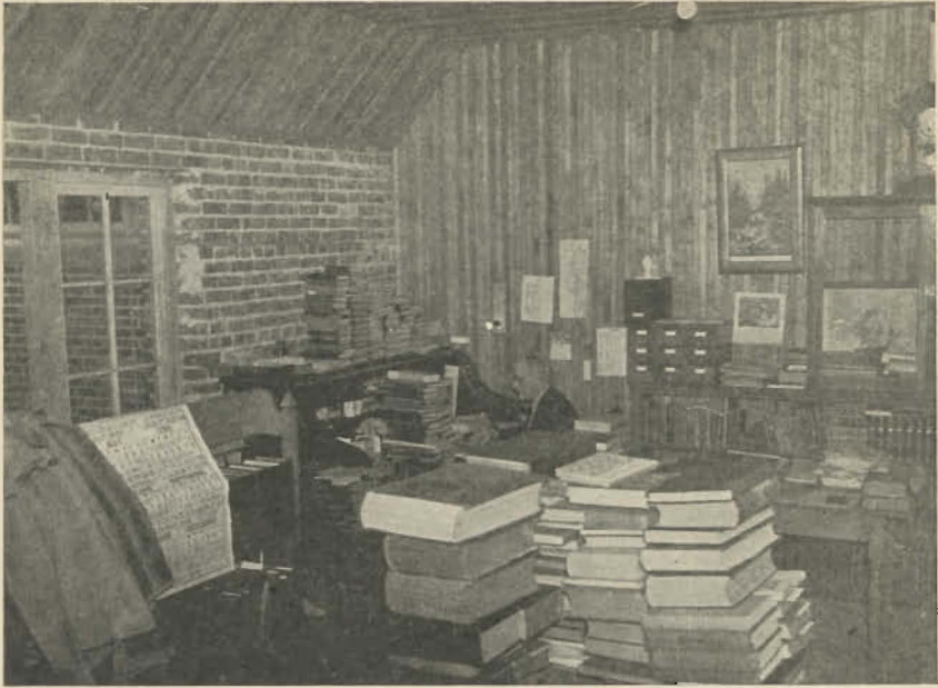
Librarian's office in its present state. The crowded condition will disappear with the installation of stacks.