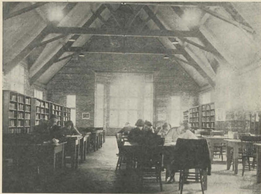
Main reading room, showing unfinished walls and floor and temporary book-cases and light fixtures. Ultimate seating capacity, 200.