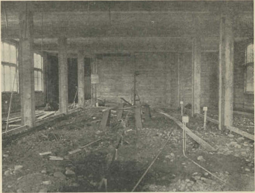
East wing of the first floor, intended for class-rooms and office space. The immediate completion of this part is very urgent.