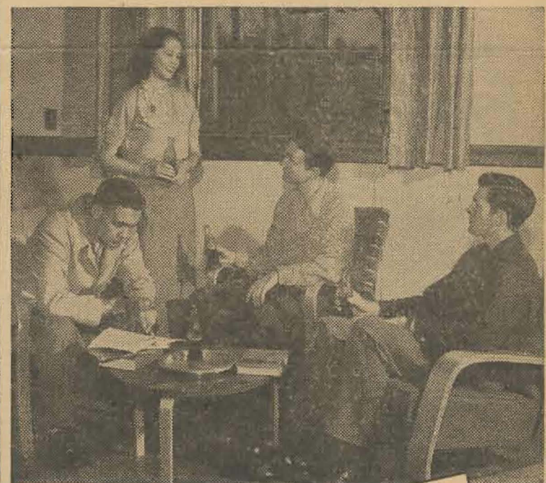
Student Center Tulane University New Orleans, La.