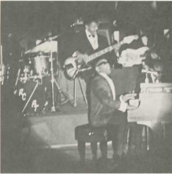
"The Genius" sings the blues