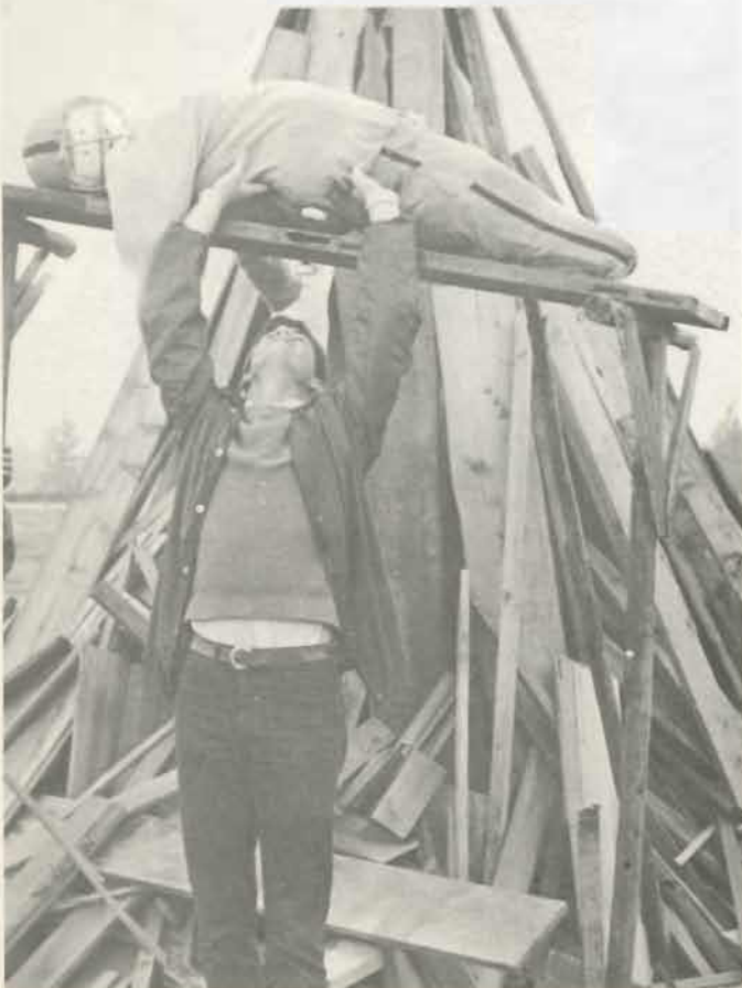
Freshmen prepare for bonfire ritual