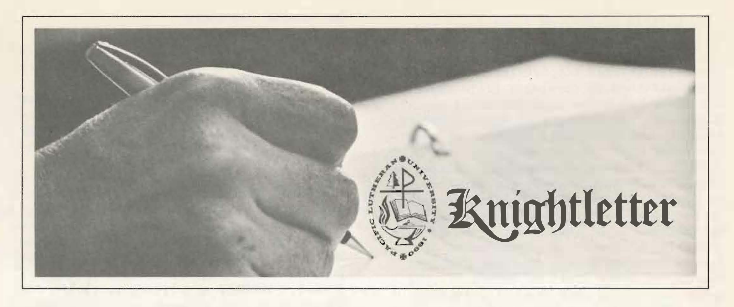
VOL 7 NO 2 Pacific Lutheran University September 18, 1969